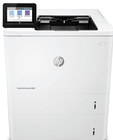
HP LaserJet Enterprise M608x