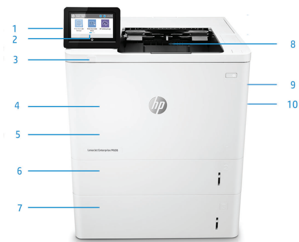
HP LaserJet Enterprise M608x