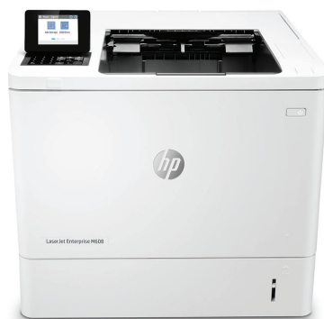
HP LaserJet Enterprise M608dn